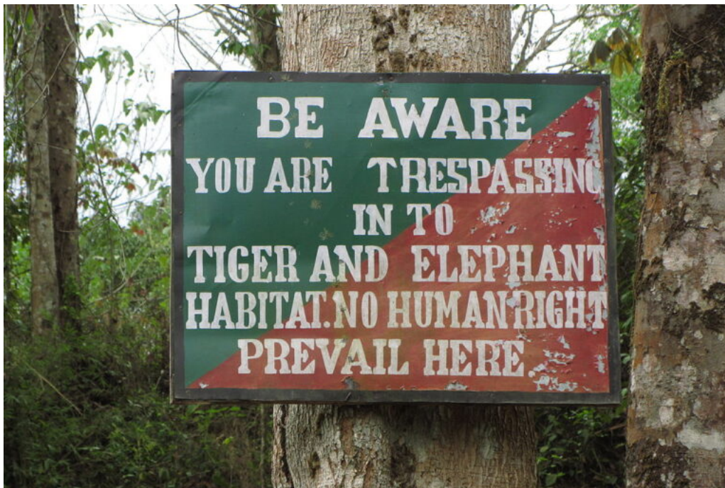
A sign in Pakke Tiger Reserve in Arunachal Pradesh. The environment ministry claims figures of 'encroachment' at regular intervals; on March 28, 2025, it submitted on affidavit that 13,05,688.387 hectares of forest land in 20 states and five union territories are 'encroached'.