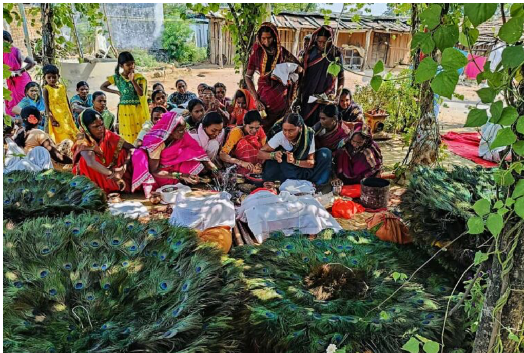
Women of Central India's Gond tribe during a festival. A nationwide struggle by forest dwellers in the early 2000s resulted in the Forest Rights Act, 2006. It recognised forest rights in eligible forest dwelling communities.

With the notification of the Forest Rights rules in 2008, the environment ministry affirmed in its 2009 Country Report to the FAO that FRA 'assigned rights to protect around 40 million ha of community forest resources to village level democratic institutions. The fine-tuning of other forest-related legislations is needed with respect to the said Act.' This figure of 40 million ha, over half of all forests in the country, was independently corroborated years later in ' Potential for Recognition of Community Forest Resource Rights Under India's Forest Rights Act ', a 2015 study. It relied on the data from the State of Forest Report, 1999 , Census 1991 and Census 2001 . Instead of amending the pre-FRA laws that are founded on the colonial notion that forest-dwellers are encroachers and their life inside the forests a crime, the environment ministry did just the opposite : It went about hacking the FRA through administrative fiat, encouraging scant regard for the law by the Forest Departments in the forests. So too the 2006 amendment to the Wildlife Protection Act, 2006 (WLPA) that made Tiger Reserves a statutory category continues to be steadfastly ignored and violated. Section 38V of WLPA which made rights recognition of forest dwellers a necessary pre-condition for creation of Tiger Reserves is patterned on the FRA.