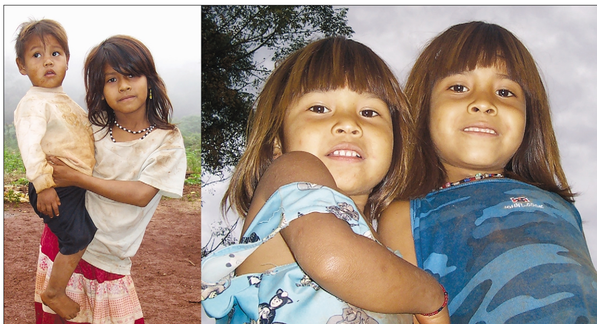
Figure 1: Mbya Guaraní children in Tekoa Yma village, Yabotí Biosphere Reserve, Misiones, Argentina, 2005

Children from Tekoa Yma, an isolated community of Mbya Guaraní indigenous people who live in northeast Argentina. Mbya Guaraní is their first language, which, with other variants of Guaraní, is spoken in Argentina, Brazil, Paraguay, and Bolivia. 16 Tupi-Guaraní peoples once had extensive territories of what are now some of the world's largest nations.