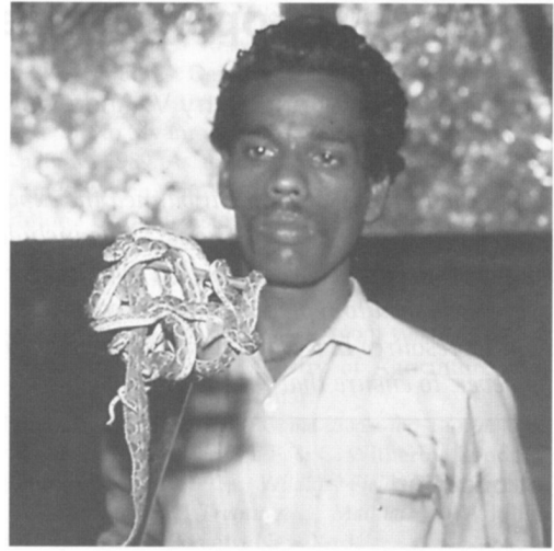
Above: An Irula snake collector with saw-scaled vipers (R. Whitaker).