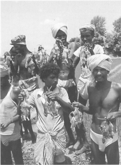
Irulas with a morning's catch of field rats (R. Whitaker).