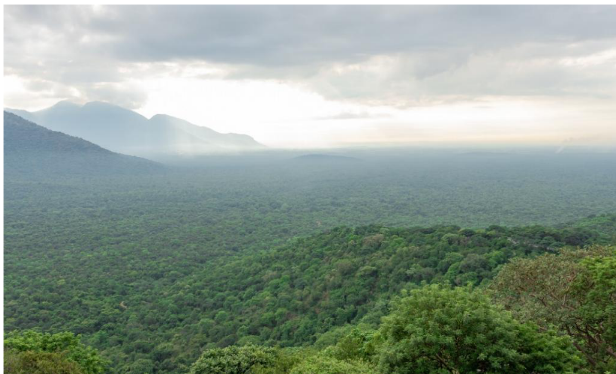
Cloud forests in Karnataka.

By Himanshu Nitnaware ( https://www.downtoearth.org.in/author/himanshu-nitnaware-169360 ) Published: Sunday 02 July 2023