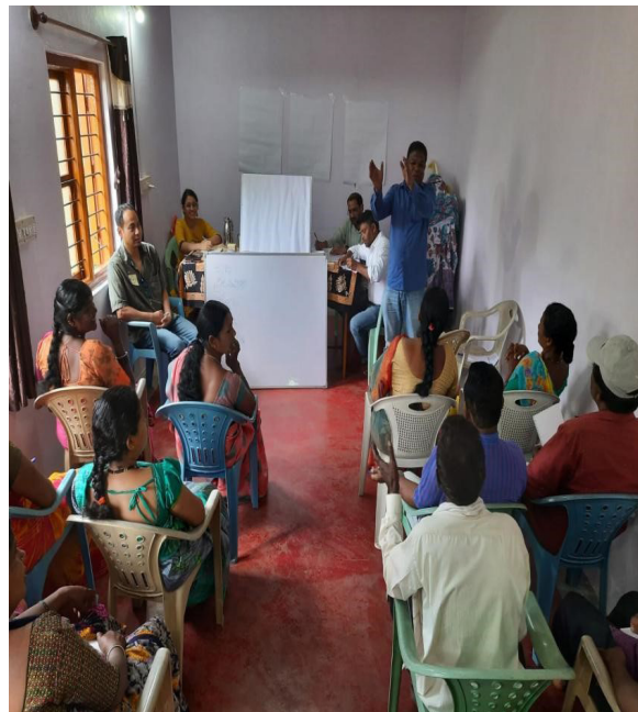
Fig. 2: Participatory workshop at BRT Tiger Reserve in 2023 involving different gender and age group

Using PRA tools was ideal for engaging the Soliga tribe in the BRT Tiger Reserve, as it allowed for gathering in-depth information that are grounded