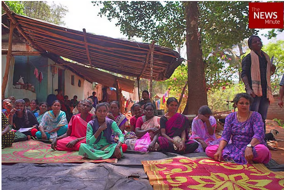
Adivasi residents and conservation activists at Bommadu Hadi, a village in the forests of Nagarahole