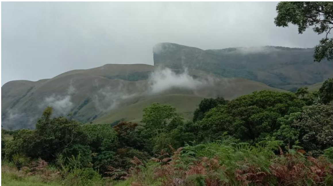
Kudremukh National Park forest

There are about 300 Malekudiya tribal families living inside the Kudremukh National Park forest limits.