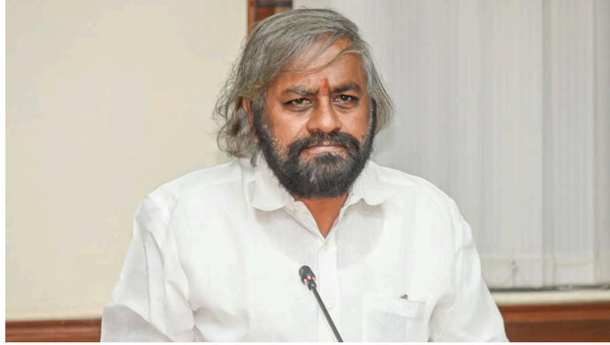
Karnataka's Forest, Ecology and Environment Minister Eshwar Khandre.

Mangaluru: The government has addressed concerns and confusion regarding the Kasturirangan report and has rejected it, said Forest Minister Eshwar Khandre .