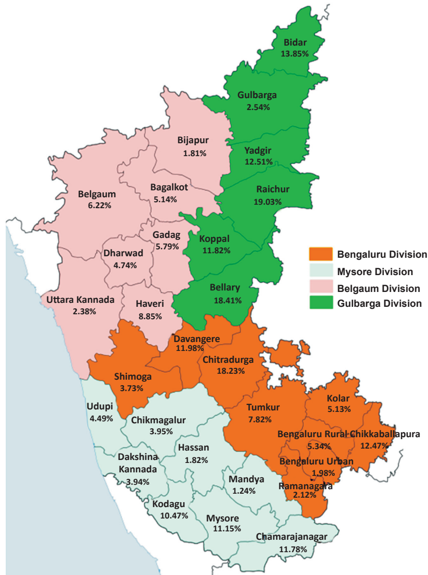
Fig. 1. Map of Karnataka showing tribal population as percentage of total population in each of its 30 districts. Source: Ref. 2.

Currently there are 50 Scheduled Tribes (ST) in Karnataka notified according to the Constitution (Scheduled Tribes) Order (Amendment) Act 2003 2 . The names of these tribes, along with their population in the State and districts mostly inhabited by them are listed in the Table. As many as 14 of these tribes are either exclusively found in Karnataka or are predominant inhabitants of the State.