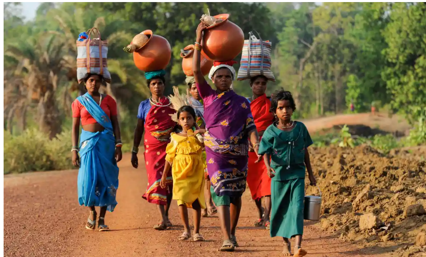
‘Adivasi tribal people make up 9% of India's 1.2 billion population.’

Adivasi have lived in the nation's forests for millennia. But now, under the spurious guise of conservation, millions face eviction