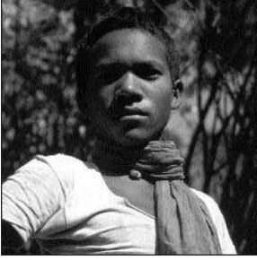
Munda boy from Mahabathian, Bihar.