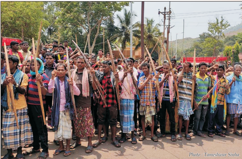
Adivasis of Baster protesting against mining in Bailadila hills, Chhattisgarh.