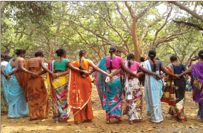
A folk dance performed during the meeting near Saranda forest in Jharkhand.