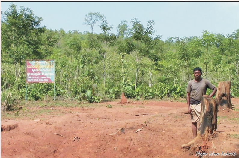
Forest Department fenced the village forest of Pidikia in Odisha.