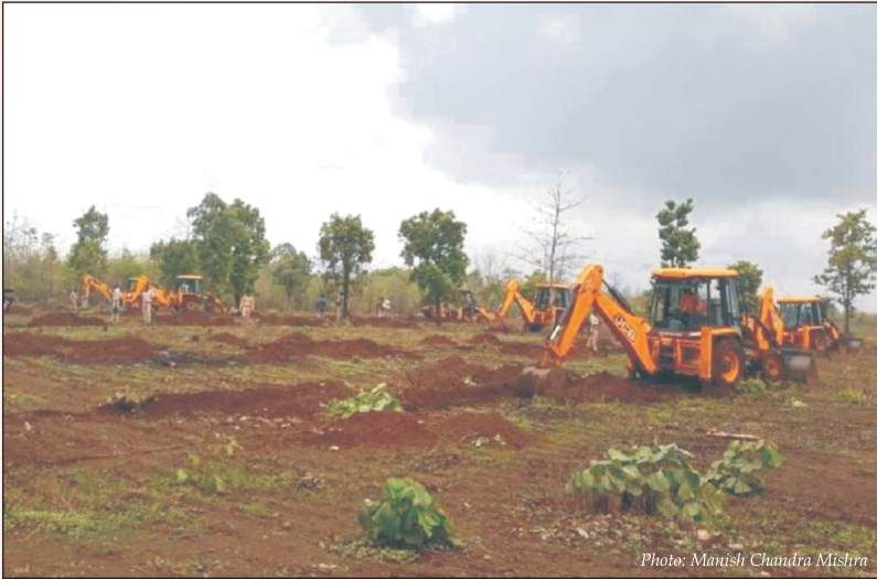
Forest Department digging pillar pits on sowed land at Siivil village in Burhanpur of MP.