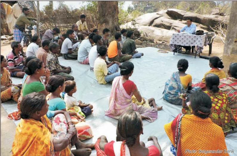
District Collector of Mayurbhanj Odisha conducting a meeting with Mankidias.