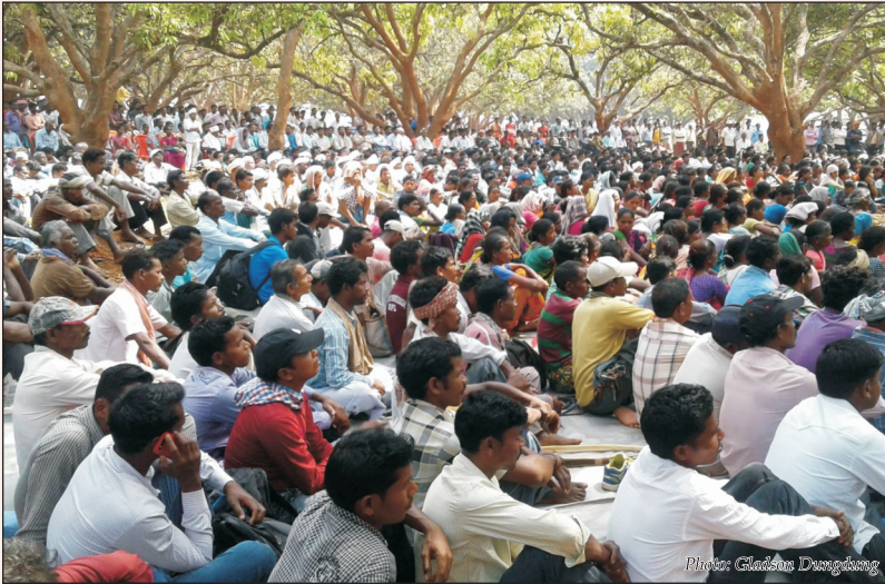
A mass meeting of Adivasis near Saranda forest in Jharkhand.