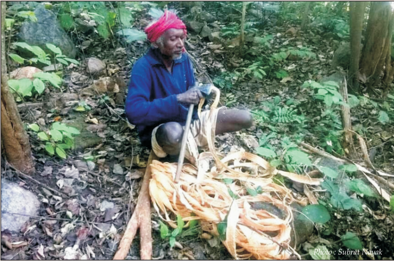
A Mankidia man collecting Siali fibres in STR, Odisha.